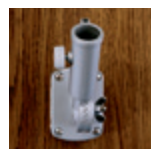
Standard Screw Mount Installation