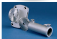
Positive Lock Fan Gears