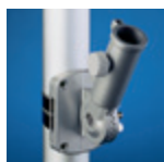
Mounted with Stainless Steel Mounting Straps