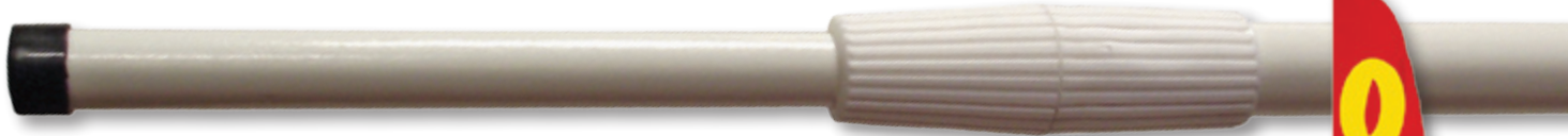
Vinyl tipped to prevent damage to flag.

These fiberglass flagpoles sway in the breeze producing a dramatic, attention-getting display. Available in both 15' and 21' exposed height sizes and comes complete with 21" PVC ground sleeve and easy-to-follow instructions. The 15' pole is adjustable from 6' to 15' while the 21' pole is adjustable from 8' to 21'. When used in combination with our NeverFurl flag unfurlers on page 130, the visual effect is amazing. The number of flags recommended to be flown the 15' pole are: (1) 3' x 5' or (1) 4' x 6' or (2) 2' x 3'. The number of flags recommended to be flown on the 21' pole are: up to (2) 3' x 5' or up to (3) 2' x 3' or (1) 4' x 6' and (1) 3' x 5'.