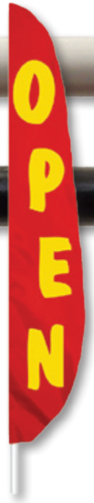
The perfect pole for Feather Flags.