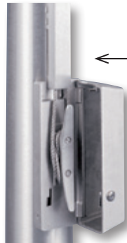
← Halyard Cover (Extends Upwards)