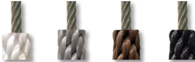
CUT-TO-LENGTH – PRICED PER FOOT