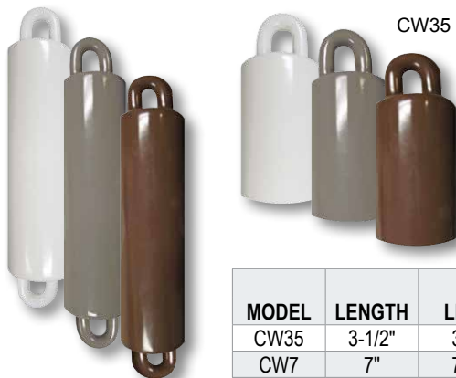
CW7 & CW14