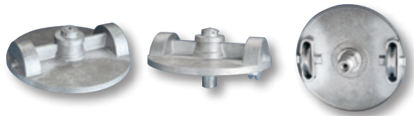
For External Halyard Poles • Threaded • Revolving • Double Pulley