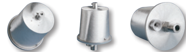
For Cable Style Internal Halyard Poles Threaded • Revolving • Single Pulley