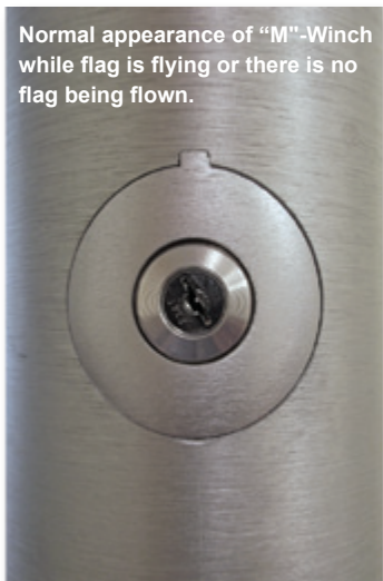
Normal appearance of "M"-Winch while flag is flying or there is no flag being flown.