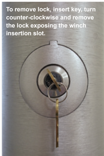
To remove lock, insert key, turn counter-clockwise and remove the lock exposing the winch insertion slot.