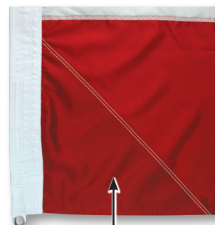
Bottom Corner Patch