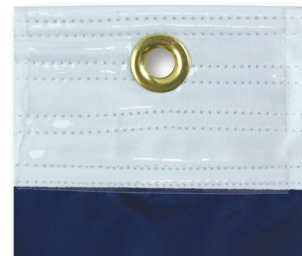
20' x 30' & larger