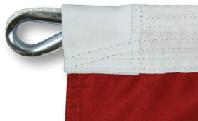
8' x 12' to 15' x 25'

8' x 12' and larger flags include plated steel rope thimbles. Thimbles are attached to white rope using a triple crimped rope sleeve. The length of the rope is sewn into the header to stabilize its position and prevent bunching.