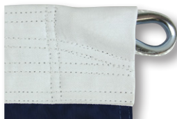
20' x 30' & larger