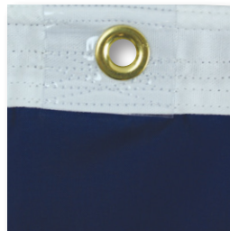
8' x 12' to 15' x 25'

8' x 12' and larger flags include a heavy-duty plastic reinforcement sleeve at each grommet location.