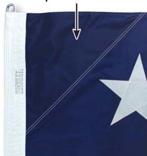
Top Corner Patch

10' x 15' and larger flags include a 2-ply corner patch sewn into each header corner.