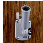
Standard Screw Mount Installation