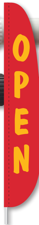
The perfect pole for our 12' x 26" Feather Flags