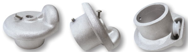
For External Halyard Poles • Cap Style • Stationary • Single Pulley