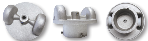
For External Halyard Poles • Cap Style • Stationary • Double Pulley