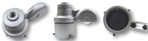
For External Halyard Poles • Cap Style • Revolving • Single Pulley