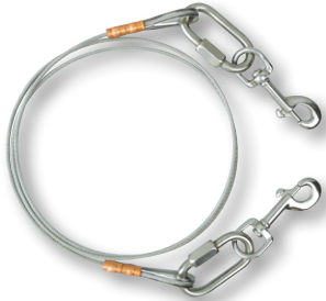
Arrangement for flag size 6' x 10' or smaller