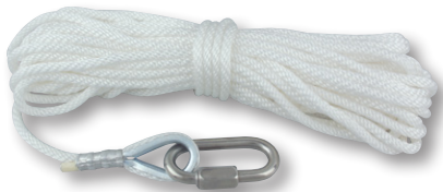
Poly Rope Assembly # 360096 shown