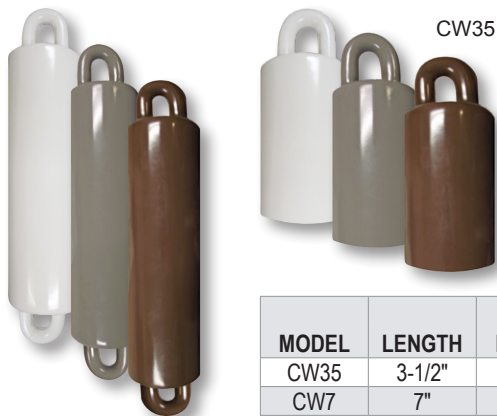
CW7 & CW14